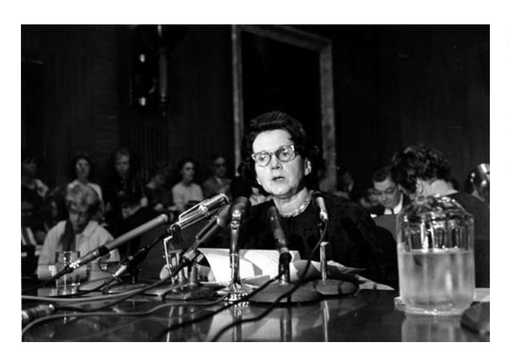
Carson testifies at a 1963 Senate hearing on pesticides, where she advocated creating a government regulatory agency for pesticides.

committees and called for establishment of a "Pesticide Commission" or some type of regulatory agency to protect people and the environment from chemical hazards.