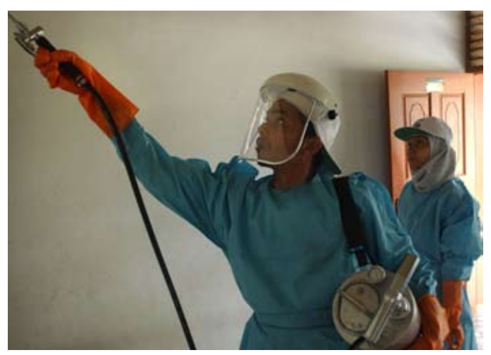
In recent times pesticides have been used with more discretion, tion that chemical in- as demonstrated by these Indonesian workers spraying mossecticides must never quito repellent after the 2004 tsunami.

This "informed use" approach today underlies "integrated pest management" (IPM), the prevailing approach for controlling pests of all descriptions. IPM, as the name suggests, integrates a number of useful strategies—chemical, cultural, and biological-into an ecologically sound, socially acceptable, and economically viable program.