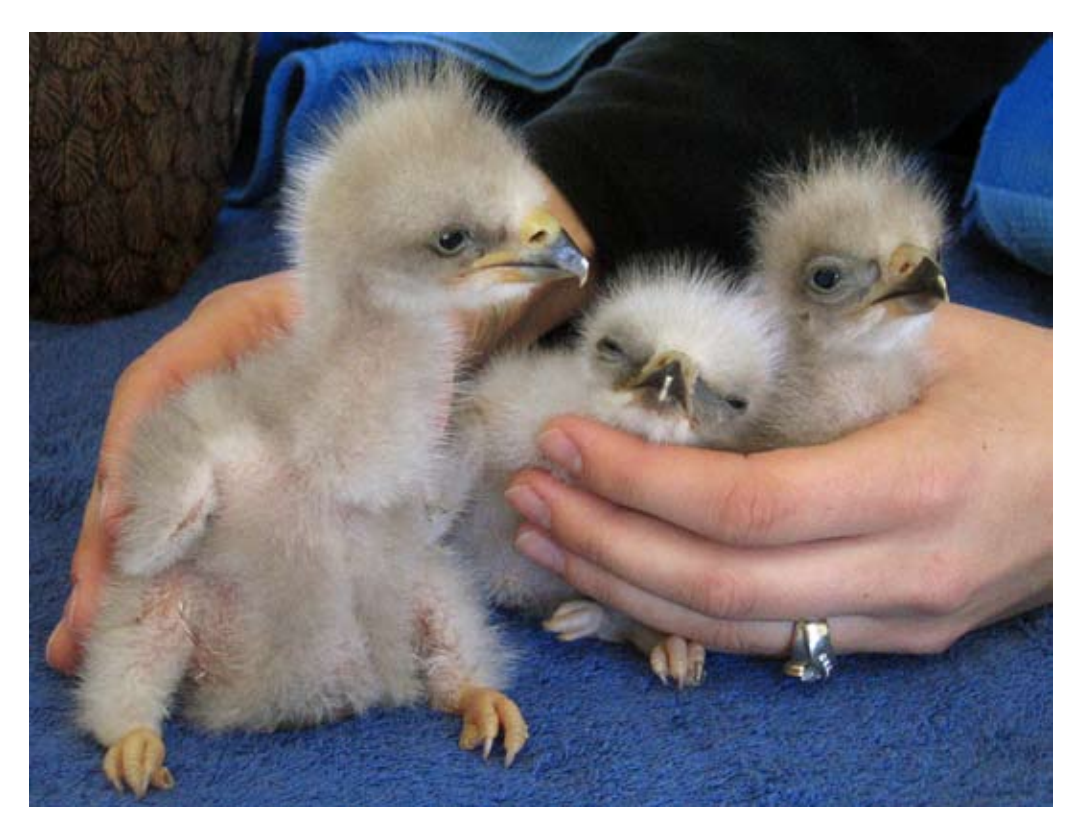
These bald eagle chicks, raised by volunteers, were hatched from eggs retrieved from wild nests on Santa Catalina Island off the California coast where DDT contamination still persists.