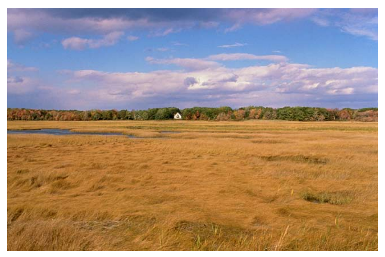
This wetland marsh is part of the Rachel Carson National Wildlife Refuge, which comprises 10 parcels of land scattered across about 80 kilometers of Atlantic coastline near Carson's summer home in Maine.