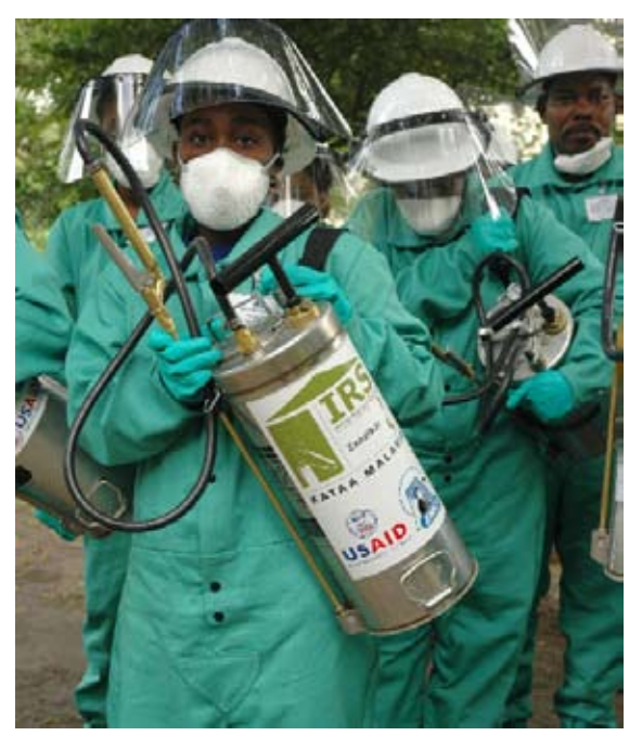
Today the informed use of insecticides allows them telligent use of chemicals." to be applied to kill or repel malaria-transmitting Whatever her position, it mosquitoes, as here in Zanzibar.

the same elegant, compelling prose that changed history.