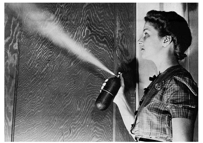
Spring, is recognizable Decades ago DDT was used indiscriminately, including in aerosol cans for spraying against houseflies.

serialized in the New Yorker magazine, more than 40 bills aimed at controlling use of DDT and other synthetic organic insecticides had been introduced in state legislatures across the United States. In 1972, eight years after Carson's death, the newly established Environmental Protection Agency banned the domestic use of DDT.