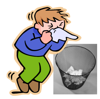
Use a tissue and throw your tissue away.