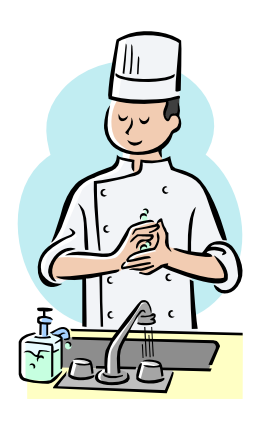
5. Wash your hands