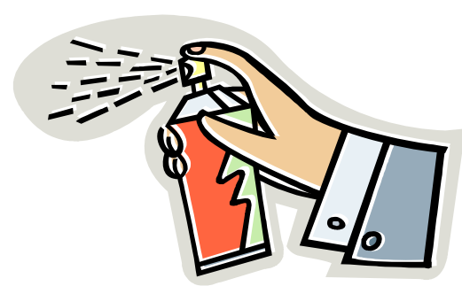
3. Clean with a germ killing disinfectant.